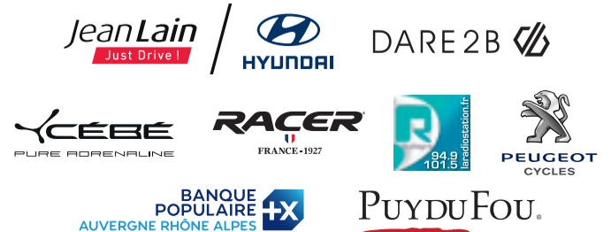
Création & Impression Ledwines - 04 79 07 06 39

From the Maignonne car park, walk back down the road until the residence Jean Franco. Take the path to your left and continue until you reach a wooden basin. This place is called "Lavancher", the you reach Montgesin. Nice view on the Lauziere mountains.